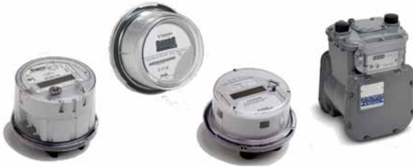
A few of the electric and gas meters currently supported by Trilliant