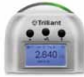
SecureMesh™ In-Home Display